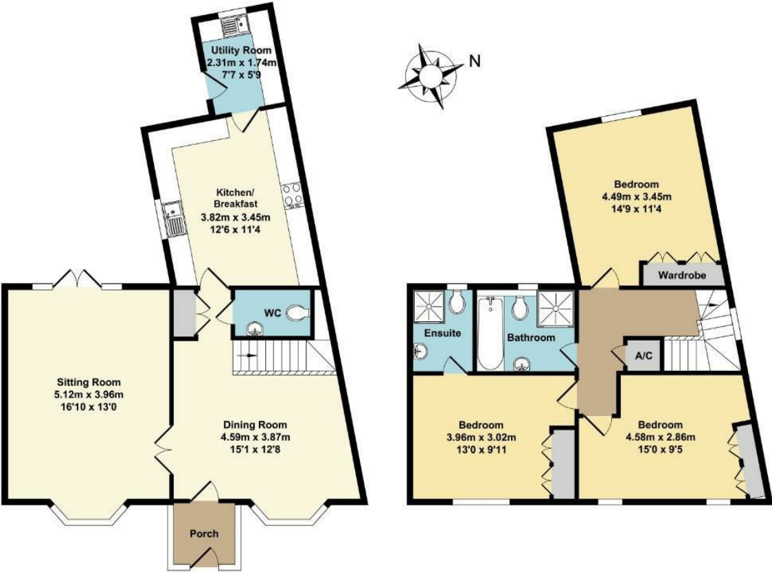
Ground Floor Approx. Floor Area 64.45 Sq.M. (694 Sq.Ft.)

Whilst every attempt has been made to ensure the accuracy of the floor plan contained here, measurements of doors, windows, rooms and any other items are approximate and no responsibility is taken for any error, omission, or mis-statement. This plan is for illustrative purposes only and should be used as such by any prospective purchaser. The services systems and appliance shown have not been tested and no guarantee as to their operability or efficiency can be given.